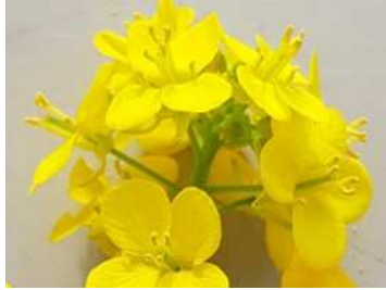
male fertile (pollen present)

Observations should be made on fully opened flowers. Tapping or shaking the flowering stem will release pollen, which, if present, can be observed on dark coloured paper or card. The absence of pollen production is an indication of male sterility. The presence of pollen production is an indication of male fertility.