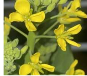
male sterile (pollen absent)